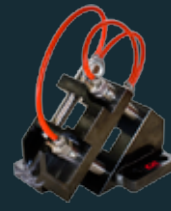
CSG - DUO SOLID