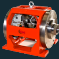
CSG - TRIO