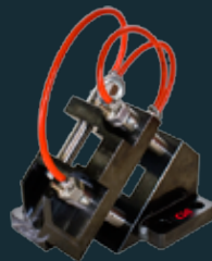
CSG - DUO SOLID