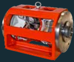
CSG - TRIO SOLID