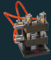
CSG - DUO MULTI MINI