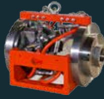
CSG - TRIO MINI