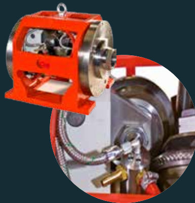
CSG - TRIO