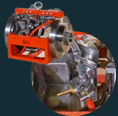
CSG - TRIO MINI